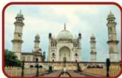
Bibi Ka Maqbara Chh. Sambhajinagar