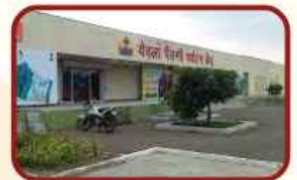
Paithani Park Yeola