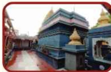
Guru Shukracharya Temple Bet-Kopergaon