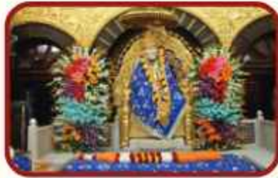
Shri Saibaba Temple, Shirdi