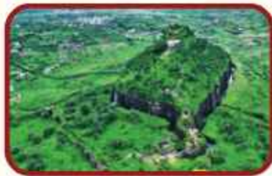
Deogiri Fort, Daulatabad, Chh. Sambhajinagar