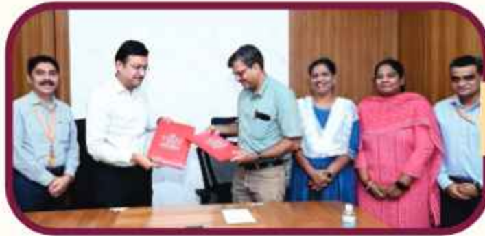
MOU with VIGYAN ASHRAM