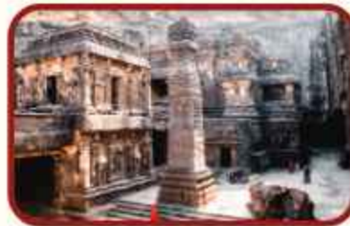
Ellora Caves, Dist. Chh. Sambhajinagar