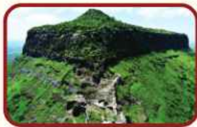
Ankai Fort Near Manmad