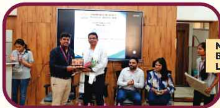
MOU with Bajaj Finserv Ltd.