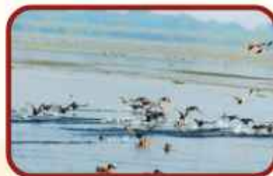
Nandur Madhyameshwar Wildlife Sanctuary