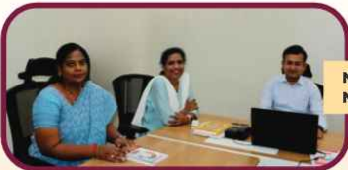
MOU with NASSCOM