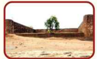
Raghoba Dada Wada Hingani, Kopergaon