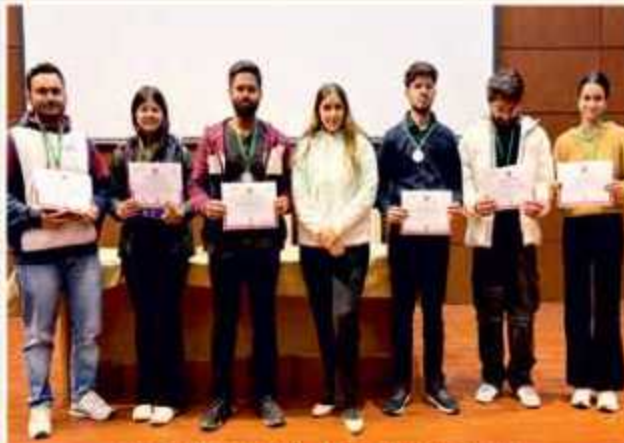
SHEETS & BEATS- TEAM BASED QUIZ