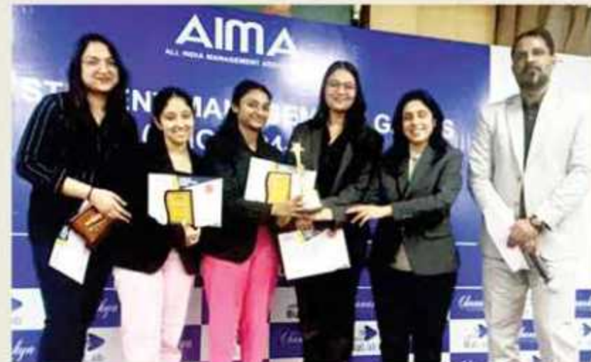
Second Runner up of the Regional Round (North) of the 28th Student Management Games