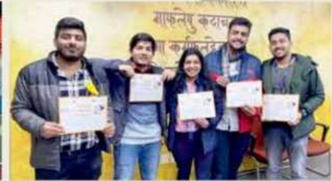
Team DSB Secured the top position at 'ADVERT-Creative AD Competition' the Inter College Management Competition