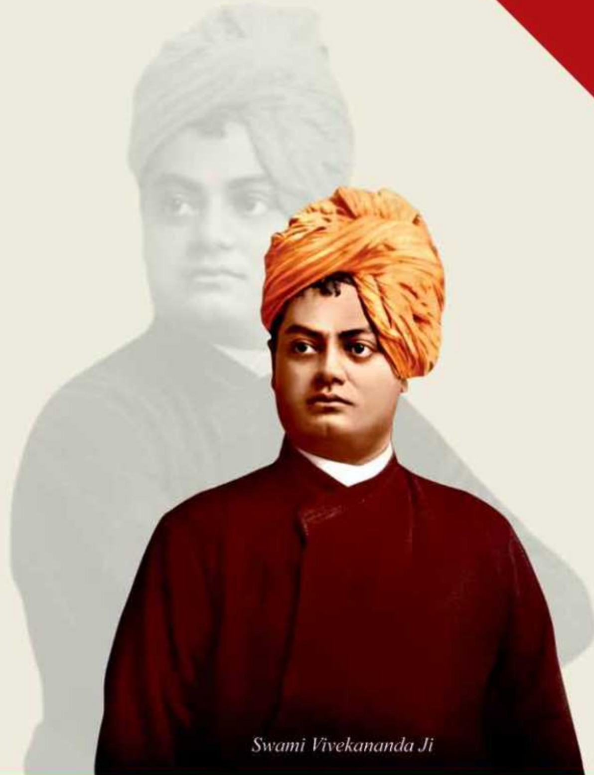
Swami Vivekananda Ji