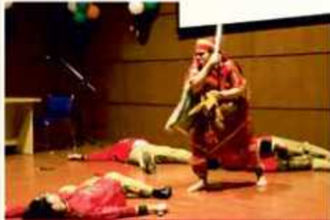
AZADI KA AMRIT MAHOTSAV