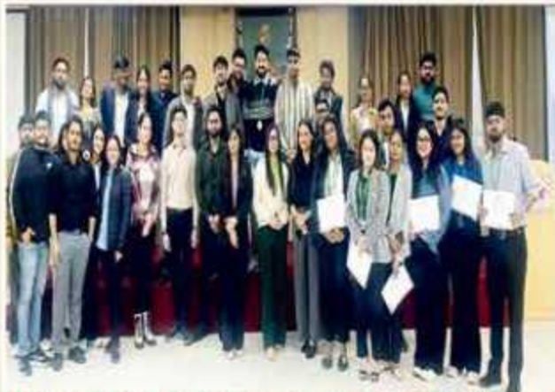
PITCH PERFECT: THE ULTIMATE ELEVATOR PITCH CHALLENGE