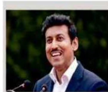
Col. Rajyavardhan S. Rathore Former Olympian The Minister of State for Youth Affairs & Sports (IC)