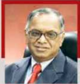
Mr. N.R. Narayana Murthy Founder, Infosys