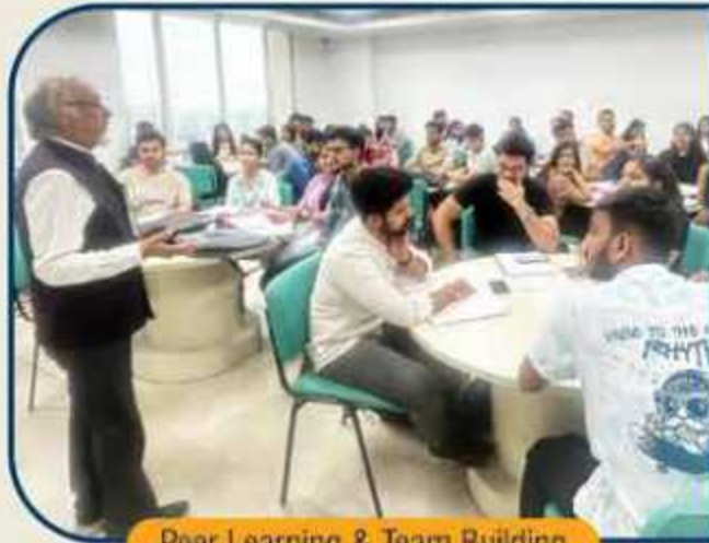
Peer Learning & Team Building

Innovative teaching methods are designed to enhance learning experiences and outcomes beyond traditional classroom practices. These innovative approaches bridge the gap between theory and practice, preparing students for real-world challenges. By engaging in hands-on experiences, collaborative problem-solving, and entrepreneurial thinking, MBA graduates develop critical skills like leadership, adaptability, and strategic decision-making—essential for success in today's dynamic and competitive business environment.