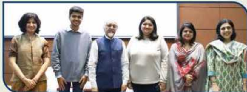
The simply Salad