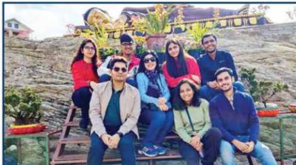
DSB Students in NIT Sikkim for AY 2022