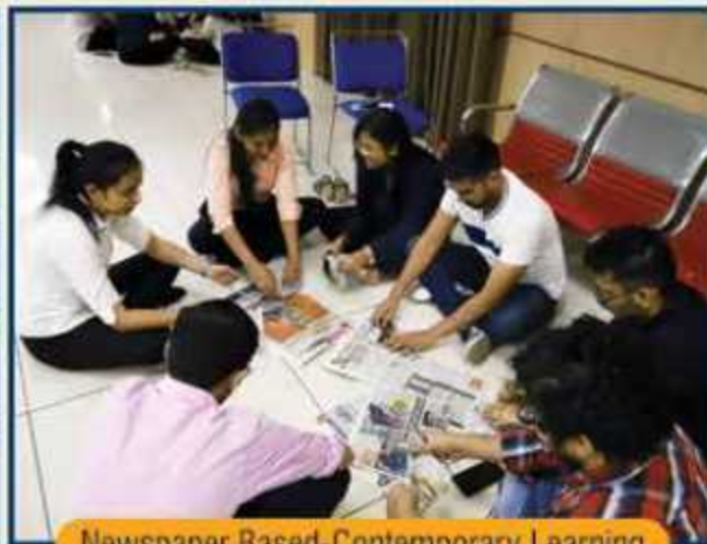
Newspaper Based-Contemporary Learning