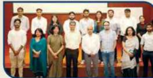
Entrepreneurship by Acquisition: Why start a business, when you can buy one!