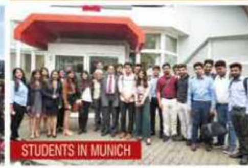
STUDENTS IN MUNICH