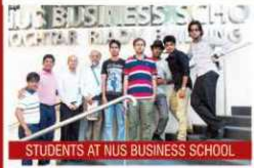
STUDENTS AT NUS BUSINESS SCHOOL