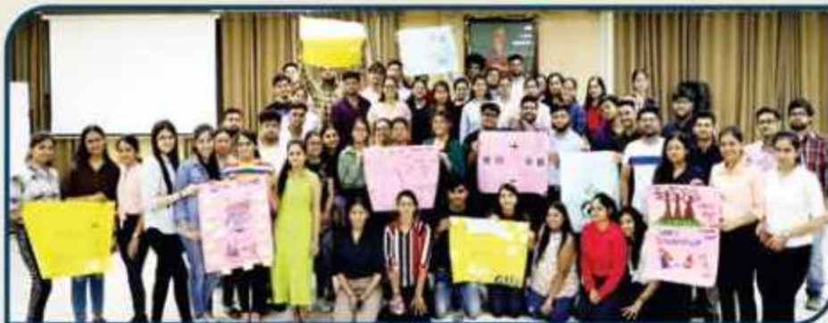
MANAGING TIME & DESTRESSING TECHNIQUE