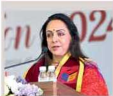
Padma Shri Hema Malini Hon'ble Member of Parliament Lok Sabha