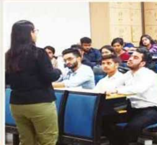
Logical Reasoning & Aptitude Test