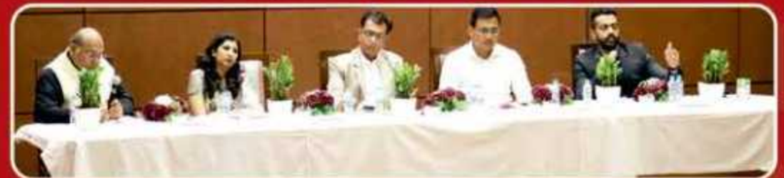
Luxury and Retail Conclave