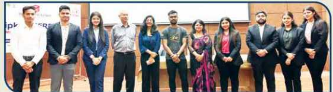
Flipkart Wired 7.0