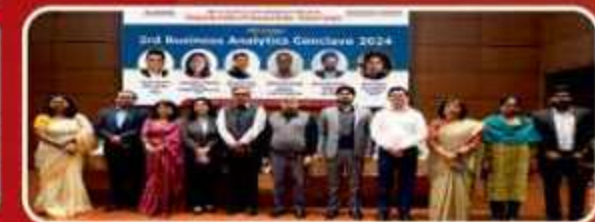
Analytics & IT Conclave