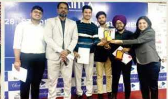
Won the Regional Round (North) for the 28th Student Management Games