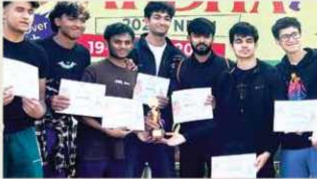
Second position in Basketball at Spardha 2025 ; Inter College Sports Meet