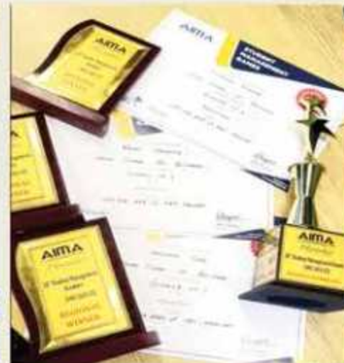
First Runner-Up in the Regional Finals of the Student Management Games, Conducted by All India Management Association (AIMA)