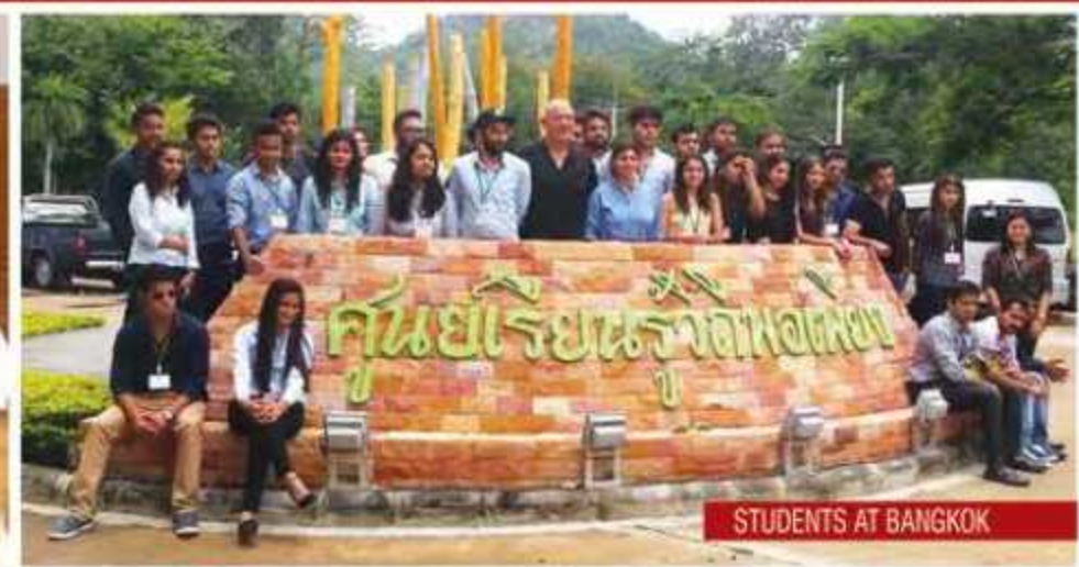
STUDENTS AT BANGKOK