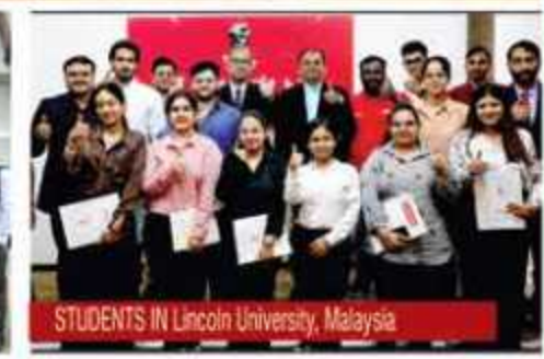
STUDENTS IN Lincoln University, Malaysia