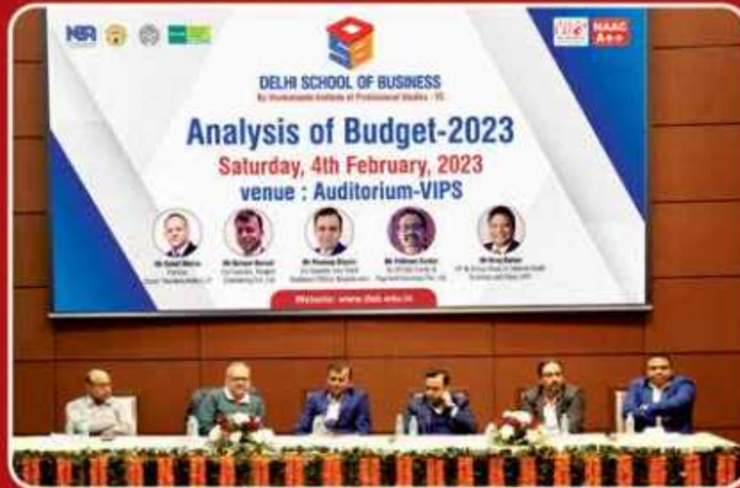
Analysis of Budget - 2023

Marketing, Analytics & IT, Corporate Governance, Corporate Social Responsibility, Luxury and Retail