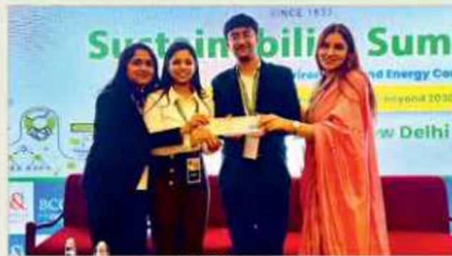
Won the ₹ 20,000/- Cash Prize at "Youth Voice Entrepreneurial Idea" event hosted by BCC&I at India Habitat Centre

At Delhi School of Business student achievement is a testament to the institution's commitment to academic excellence, leadership development, and holistic growth. Beyond classroom learning, DSB nurtures talent through industry engagements, case competitions, research initiatives, and co-curricular activities, empowering students to excel in diverse domains. DSB students consistently set new benchmarks. Their achievements not only reflect their hard work and dedication but also reinforce the institution's vision of shaping future business leaders equipped with knowledge, innovation, and ethical values.