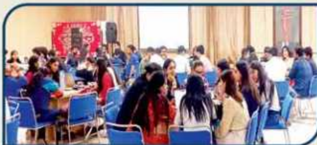
INDIAN PHILOSOPHY & MANAGEMENT PRINCIPLES