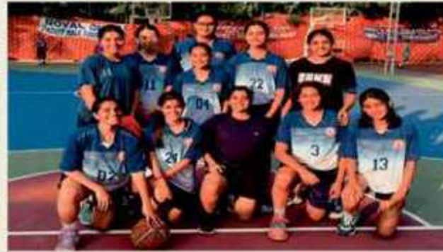
Represented Delhi state in 42nd Senior National Netball Championship for Men & Women