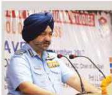
PVSM, AVSM, B.S. Dhanoa Air Chief Marshal