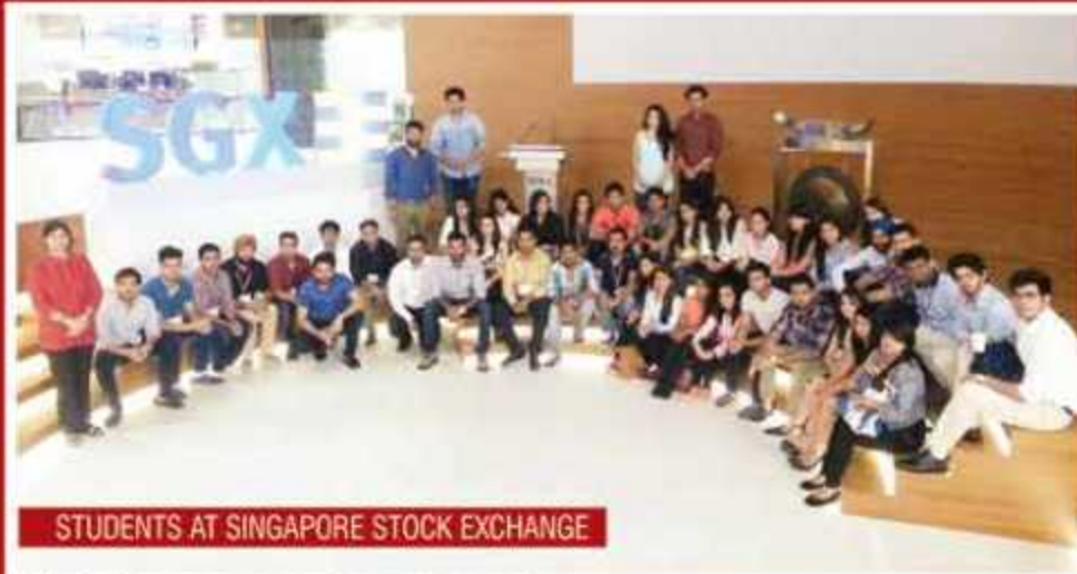
STUDENTS AT SINGAPORE STOCK EXCHANGE