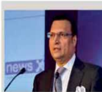
Mr. Rajat Sharma Indian journalist & Chairman and Editor-in-chief of India TV