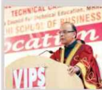
Mr. Arun Jaitely Hon'ble Minister for Finance and Corporate Affairs Govt. of India