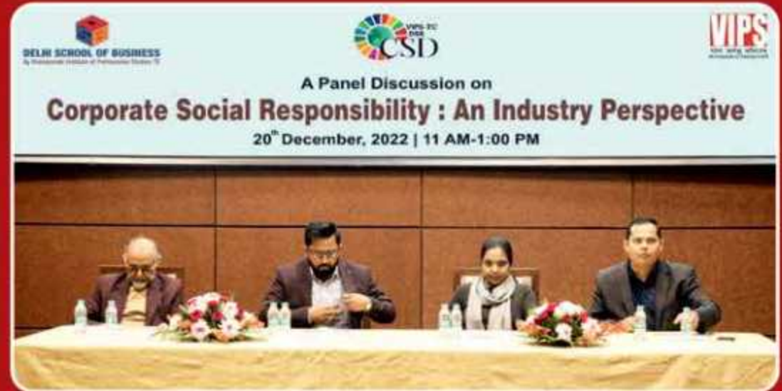
Corporate Social Responsibility Conclave