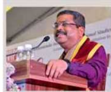
Shri Dharmendra Pradhan Hon'ble Minister of Education and Skill Development & Entrepreneurship Government of India