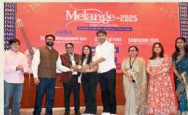
Winner of National Finals for the AIMA Student Management Quiz 2025