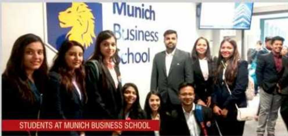
STUDENTS AT MUNICH BUSINESS SCHOOL