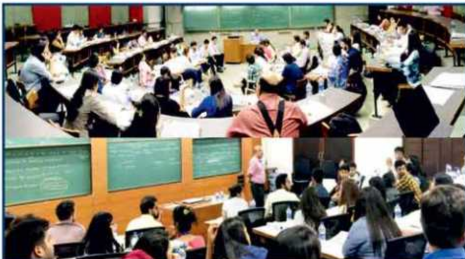
DSB Students in IIM Bangalore *IIMB for AY 2018

राष्ट्रीय प्रौद्योगिकी संस्थान, शिक्किम NATIONAL INSTITUTE OF TECHNOLOGY SIKKIM