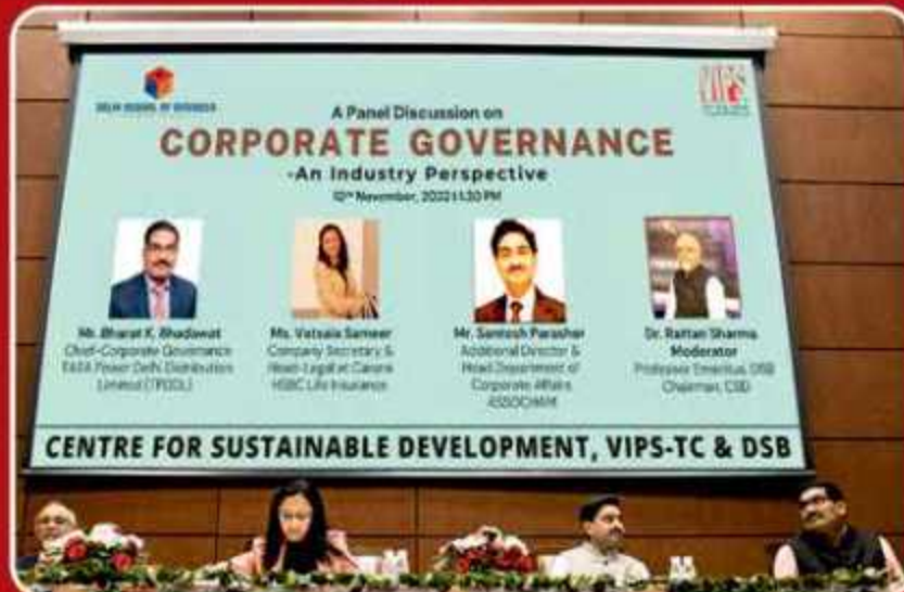
Corporate Governance Conclave