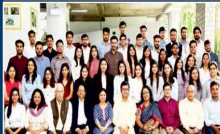
DSB Students in IIM Ahmedabad *IIMA for AY 2016

भारतीय प्रबंध संस्थान अहमदाबाद INDIAN INSTITUTE OF MANAGEMENT AHMEDABAD