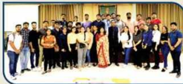
UNIVERSAL VALUES / ETHICS