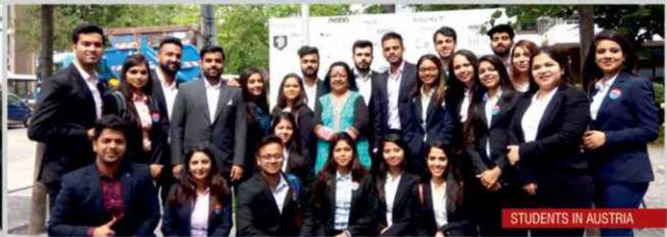
STUDENTS IN AUSTRIA