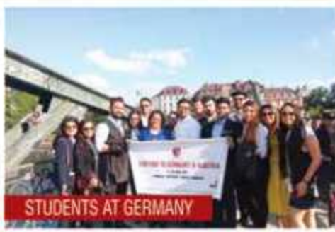
STUDENTS AT GERMANY