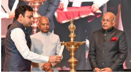
Shri Ramnath Kovind Ji Former President of India