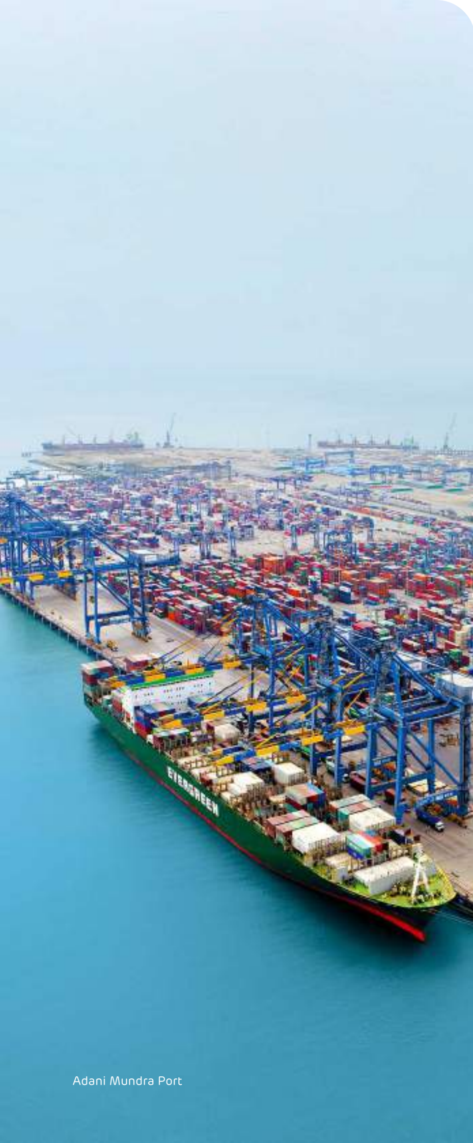
Adani Mundra Port