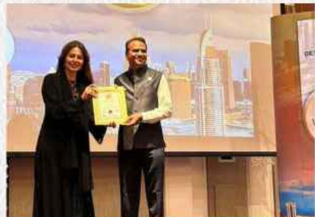
Best Institute offering Innovative Programs to Indira Institute of Management, Pune at 9 th Edition of World Marketing Congress and Awards at Taj Lands End, Mumbai