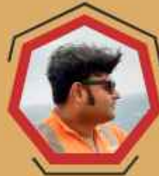
Rahul Patil Oil and Natural Gas Limited (ONGC), Package : 12 Lakh p.a.