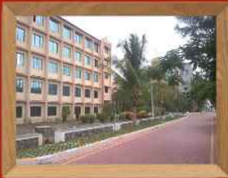
Siddhant Diploma College