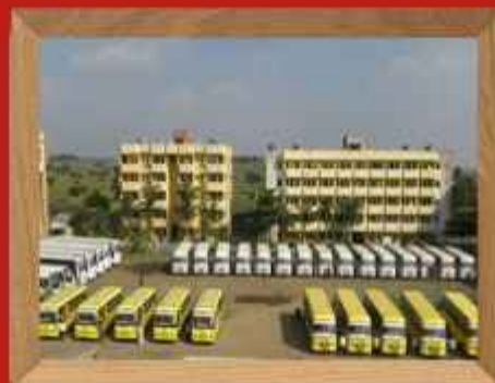
Transport facility from each corner of Pune