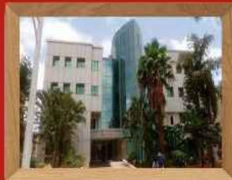
Siddhant Institute of Computer Application