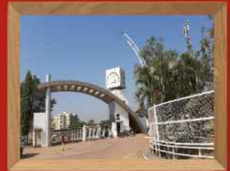
Our Institute Entrance