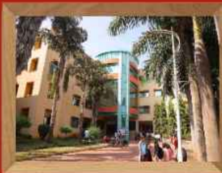
Siddhant College of Pharmacy