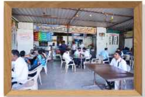
Fast Food Center