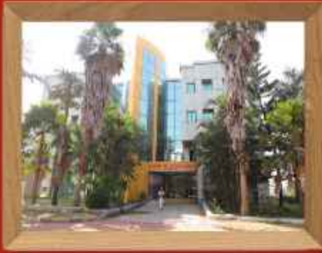
Western Business School, Pune