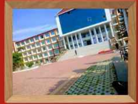
Siddhant College of Engineering, Pune