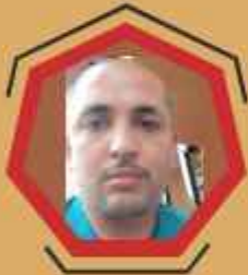
Gulshan Savale Oil and Natural Gas Limited (ONGC), Package : 14 Lakh p.a.