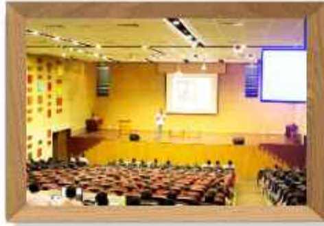
Auditorium / Conference Room