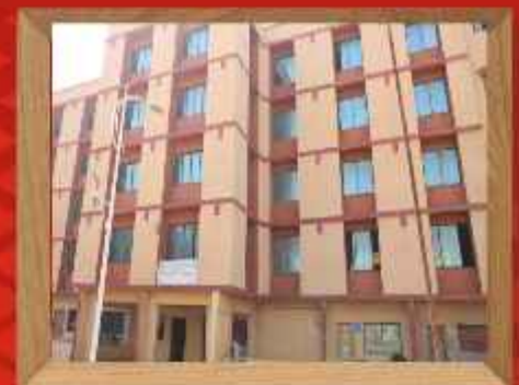
Boy's Hostel with All Amenities