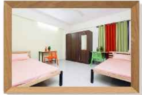
Separate Girls & Boys Hostel