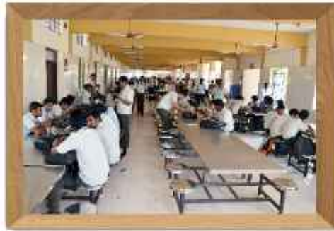
Canteen & Mess