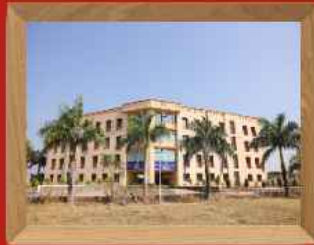
Siddhant International School