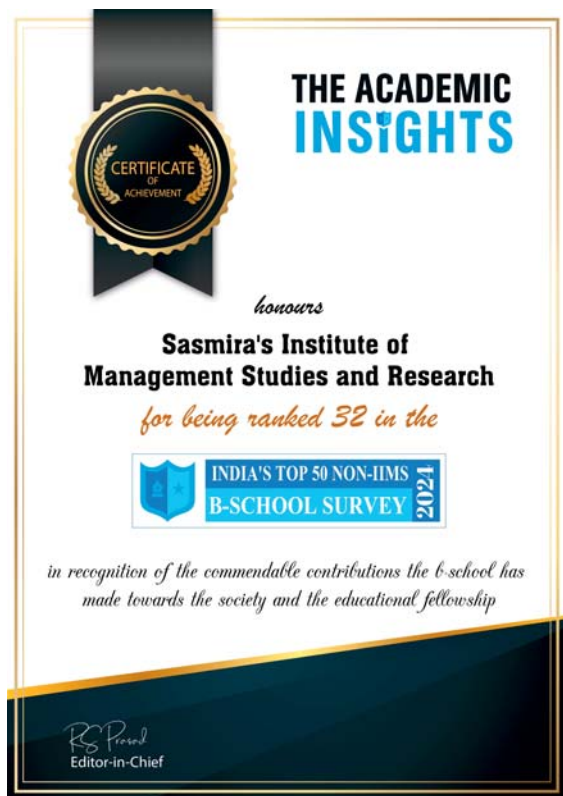
SIMSR-Ranking Academic Insights 2024