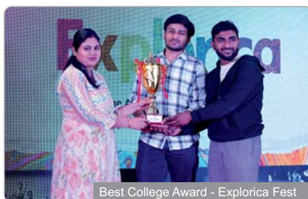
Best College Award - Explorica Fest