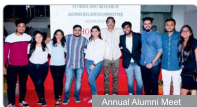
Annual Alumni Meet

MAHALAXMI SARAS - This event is an effort of government to provide market place to rural entrepreneurs and artisans. This is an excellent learning opportunity for students.