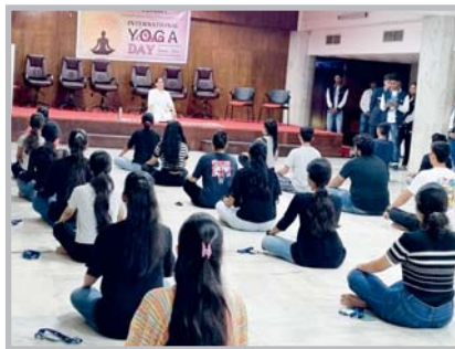
World Yoga Day