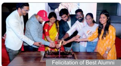
Felicitation of Best Alumni