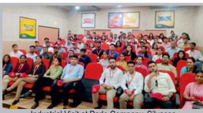
Industrial Visit at Parle Company, Silvassa