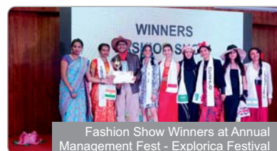
Fashion Show Winners at Annual Management Fest - Explorica Festival