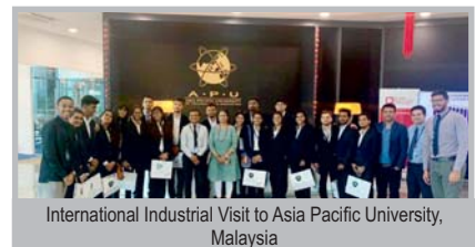
International Industrial Visit to Asia Pacific University, Malaysia