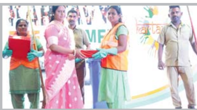
Felicitatation of Frontline Workers