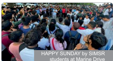
HAPPY SUNDAY by SIMSR students at Marine Drive