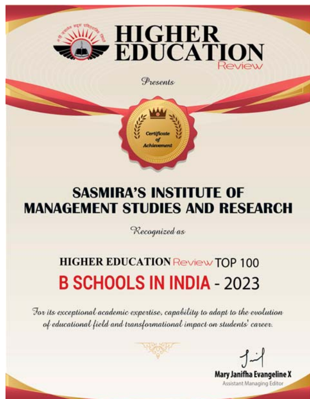
SIMSR-Ranking HIGHER EDUCATION Review 2023