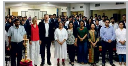
Foreign collaboration with Dokeos Curricula