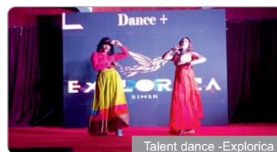
Talent dance -Explorica