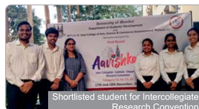
Shortlisted student for Intercollegiate Research Convention