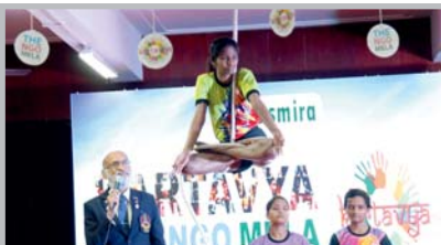
Blind students Malakhm demonstration during NGO Mela