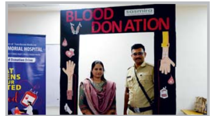
Mumbai Police donors during Blood donation Camp