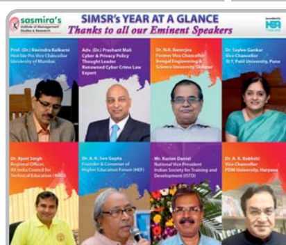
Vice Chancellors and Corporate Heads as Chief Guest and Guest of Honor