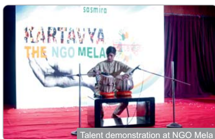
Talent demonstration at NGO Mela