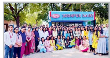
Domestic IV-SARAS Jodhpur dairy