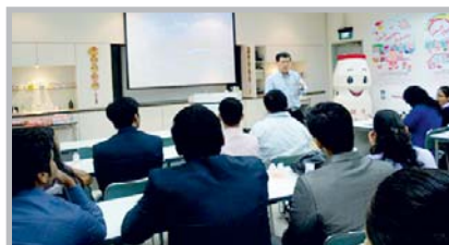
International Industrial Visit to Yakult, Singapore