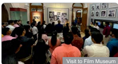
Visit to Film Museum