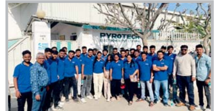
Domestic IV to Udaipur- Pyrotech Electronics Pvt. Ltd.