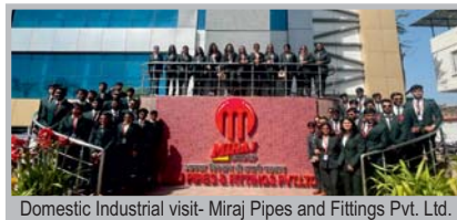
Domestic Industrial visit- Miraj Pipes and Fittings Pvt. Ltd.