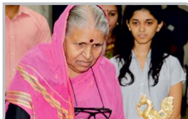
Smt. Sindhutai Sakpal Chief Guest for Kartavya NGO Mela