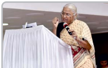
Ms. Medha Patkar Chief Guest for KARTAVYA NGO Mela