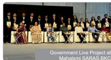
Government Live Project at Mahalaxmi SARAS, BKC