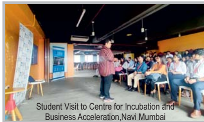
Student Visit to Centre for Incubation and Business Acceleration, Navi Mumbai