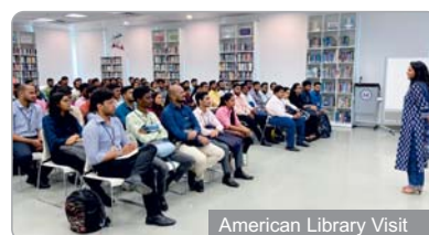
American Library Visit