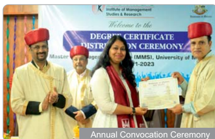
Annual Convocation Ceremony