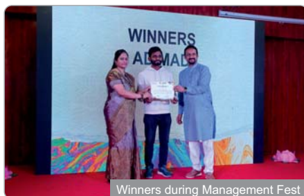
Winners during Management Fest