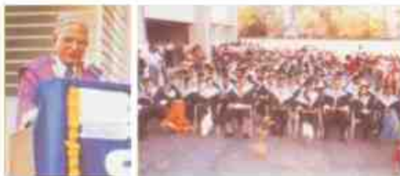
Shri Justice M. B. Shah Judge, Supreme Court of India, New Delhi Convocation - 2003