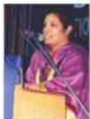
Smt. D. Purandareswaridevi Hon'ble Minister of State for HRD, Govt of India.