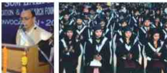
Shri Justice D.H. Waghela Former Chief Justice of Bombay High Court Convocation - 2017