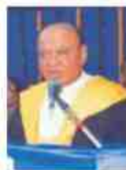
Shri Shankarsinhji Vaghela, Hon'ble Textile Minister, Government of India, New Delhi.