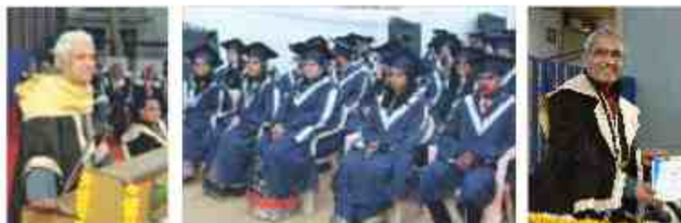
Hon'ble Justice Shri. Anil R. Dave, Former Judge, Supreme Court of India