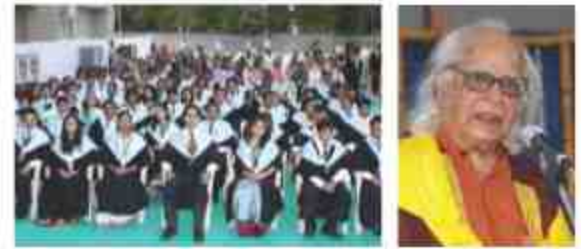
Dr. Yash Pal Padma Bhushan Former Chairman University Grants Commission, New Delhi Convocation - 2012