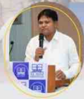
Shri Kirtkumar J. Parmar Mayor, Ahmedabad Ahmedabad Municipal Corporation