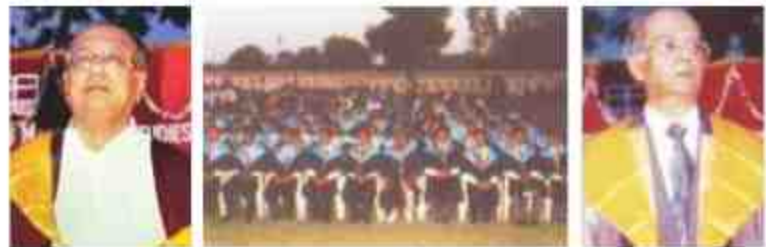
Shri. Sureshchandra Mehta Hon'ble Minister of Industries Government of Gujarat