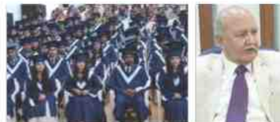
Hon'ble C. K. Buch Former Justice, High Court of Gujarat Convocation - 2018