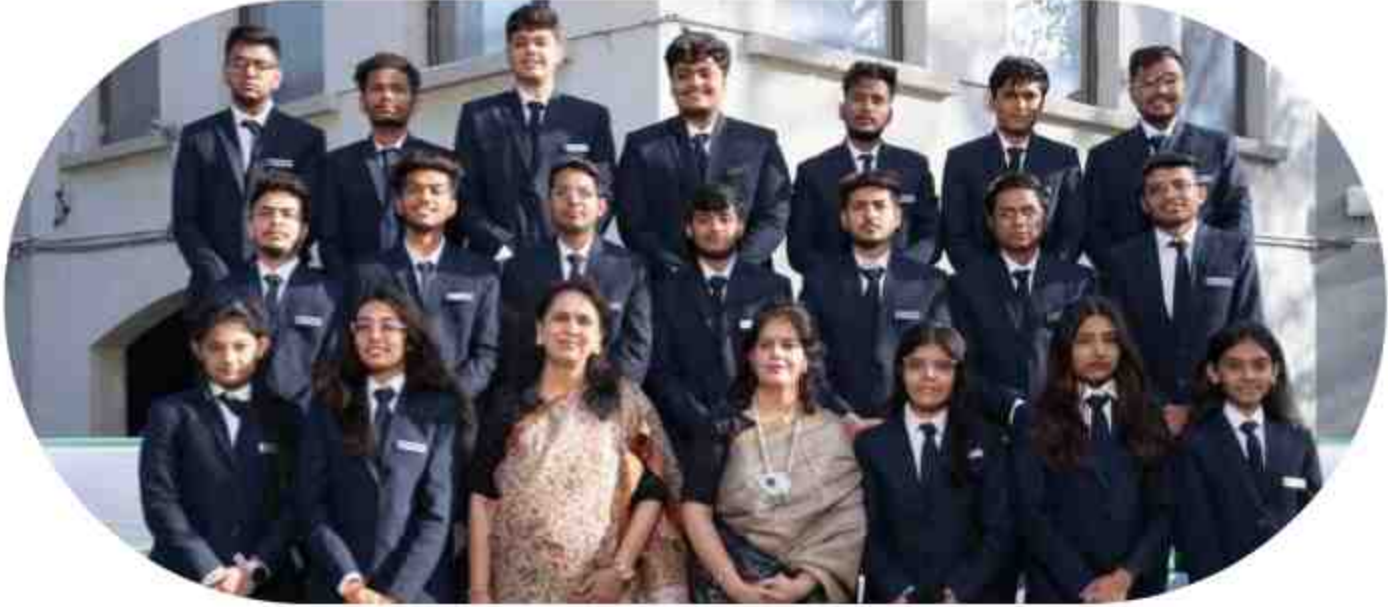
MBA (INFORMATION TECHNOLOGY)