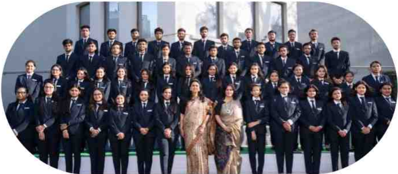
MBA (FINANCE MANAGEMENT)