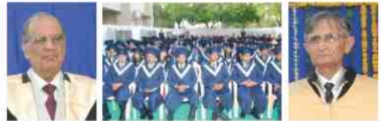
Shri Justice C. K. Thakker Former Judge Supreme Court of India