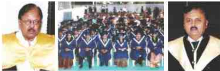
Shri Jaynarayan Vyas An Eminent Economist and Thinker