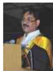
Shri. Bharatsinhji Solanki Hon'ble Minister of State for Power, Government of India, New Delhi.