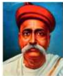
Bal Gangadhar Tilak