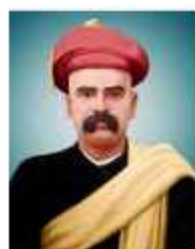
Gopal Ganesh Agarkar